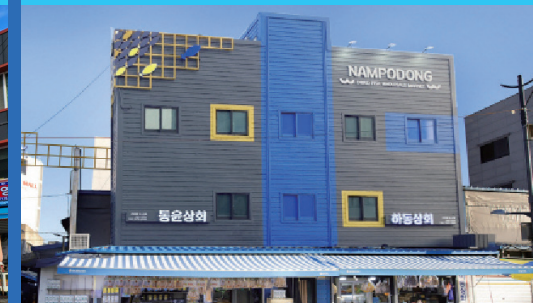
Nampo-dong Dried Fish Wholesale Market