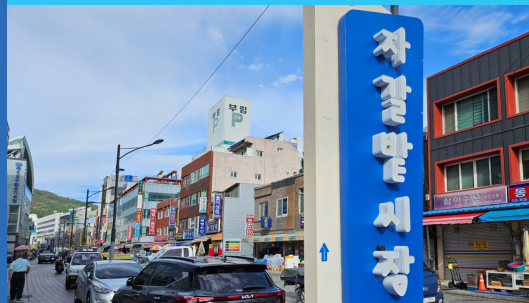
Busan Gravel Market