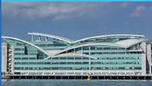
Jagalchi Market Modern Building